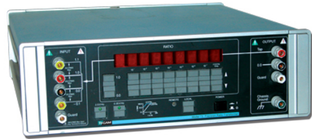
Figure 3 – TEGAM's Model PRT-73 Precision Ratio Transformer tests synchro resolvers at better than 1 arc-second (.00028 degrees) accuracy.

In Figure 1, a TEGAM Model PRT-73 is used. The PRT-73 can be controlled remotely via an IEEE-488 bus, which means this process can be automated, provided the other instruments required for the test can also be controlled remotely. The resolution of the PRT-73 is 0.1 ppm, which translates to an angular resolution of 0.0000057° or 0.02". The accuracy of the PRT-73 is dependant on the frequency of the reference and its setting. The worse case linearity specification at 50 to 1000 Hz for the PRT-73 is 0.9 ppm, which is better than 0.2" angular accuracy.